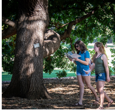
Oak Discovery Day participants explore Shields Oak Grove with the new studentcreated self-guided tour.