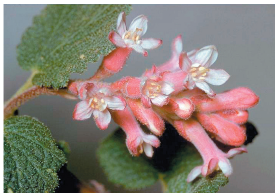
Ribes malvaceum

Correa 'Dusky Bells' is a charming Australian native that has large, long dark-pink tubular bell flowers that cover the plant in January. This is a hummingbird favorite and really cheery in the dead of winter. Ribes malvaceum 'Montara Rose' is a lovely California native that prefers part shade. It blooms in mid to late winter before much of the garden even looks alive. The flowers are an unexpected darker pink that attract hummingbirds and people alike.