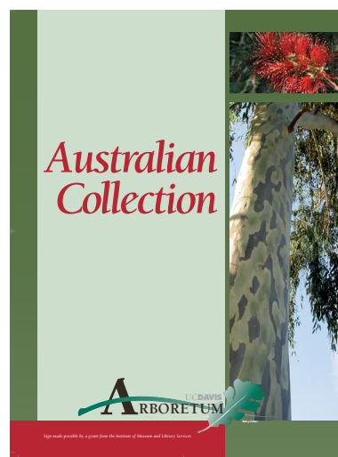
Wayfinding signs like this one for the Australian Collection help visitors navigate through the gardens.

The new exhibits are made possible by grants from the Elvenia J. Slosson Foundation, the Institute for Museum and Library Services, and the UC Davis Office of Administration Campus Sustainability Program.