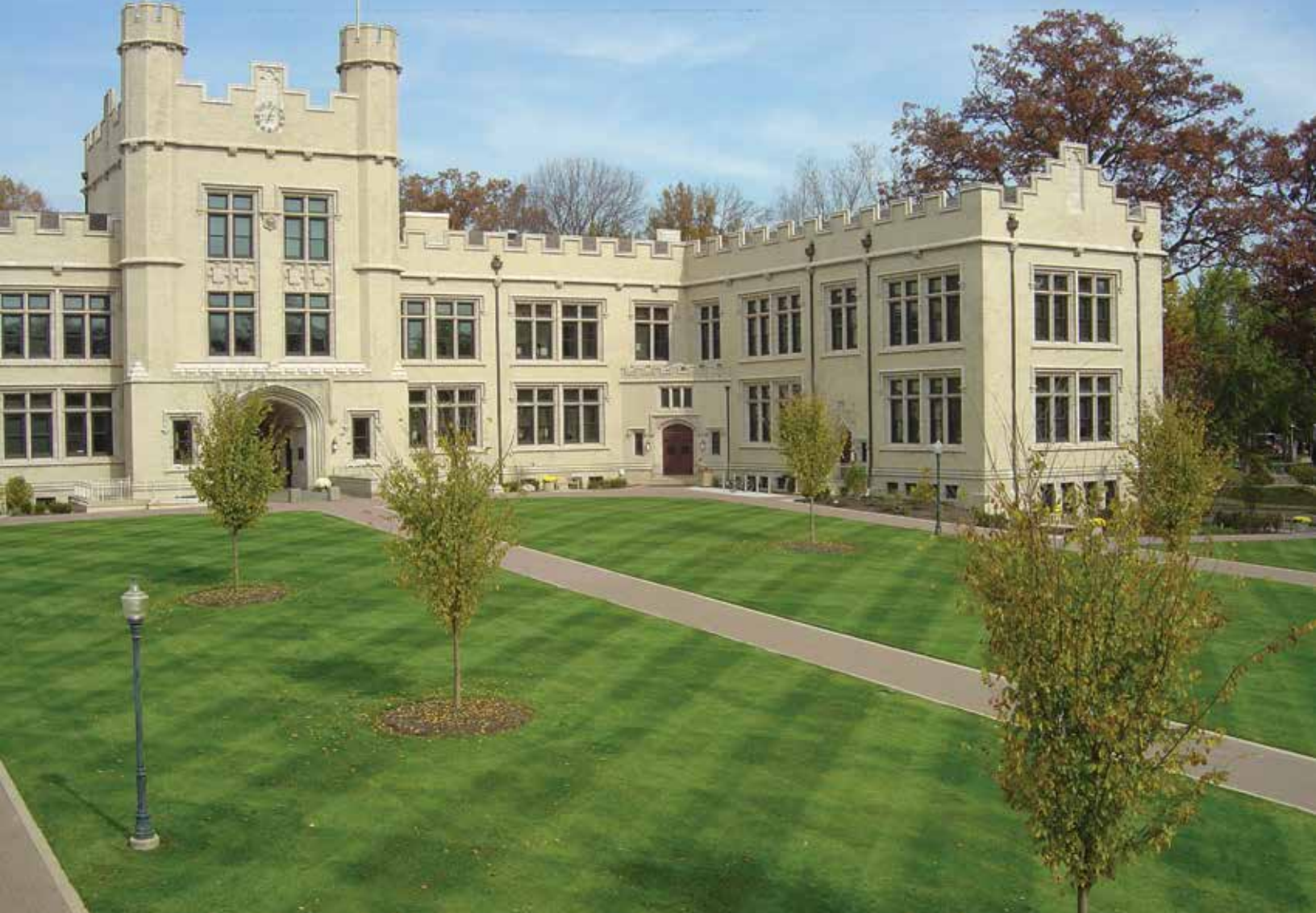
College of Wooster.